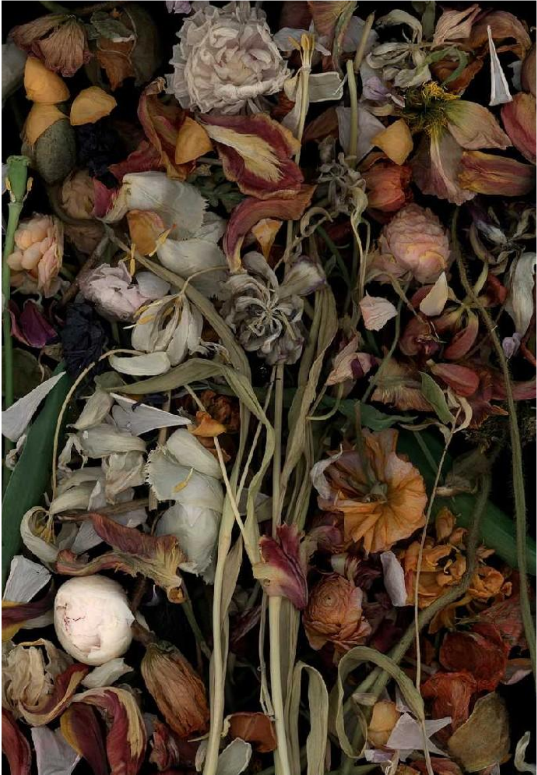
« Stockage 184 » - Lightjet print on aludibond- 177x122 cm