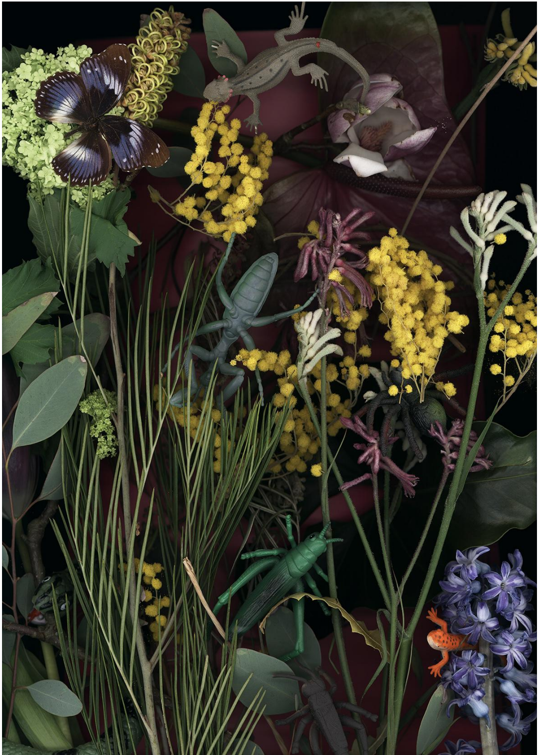
« Lustgarten 6 » - Scannogram printed directly onto aluminium - 45 x 32 cm