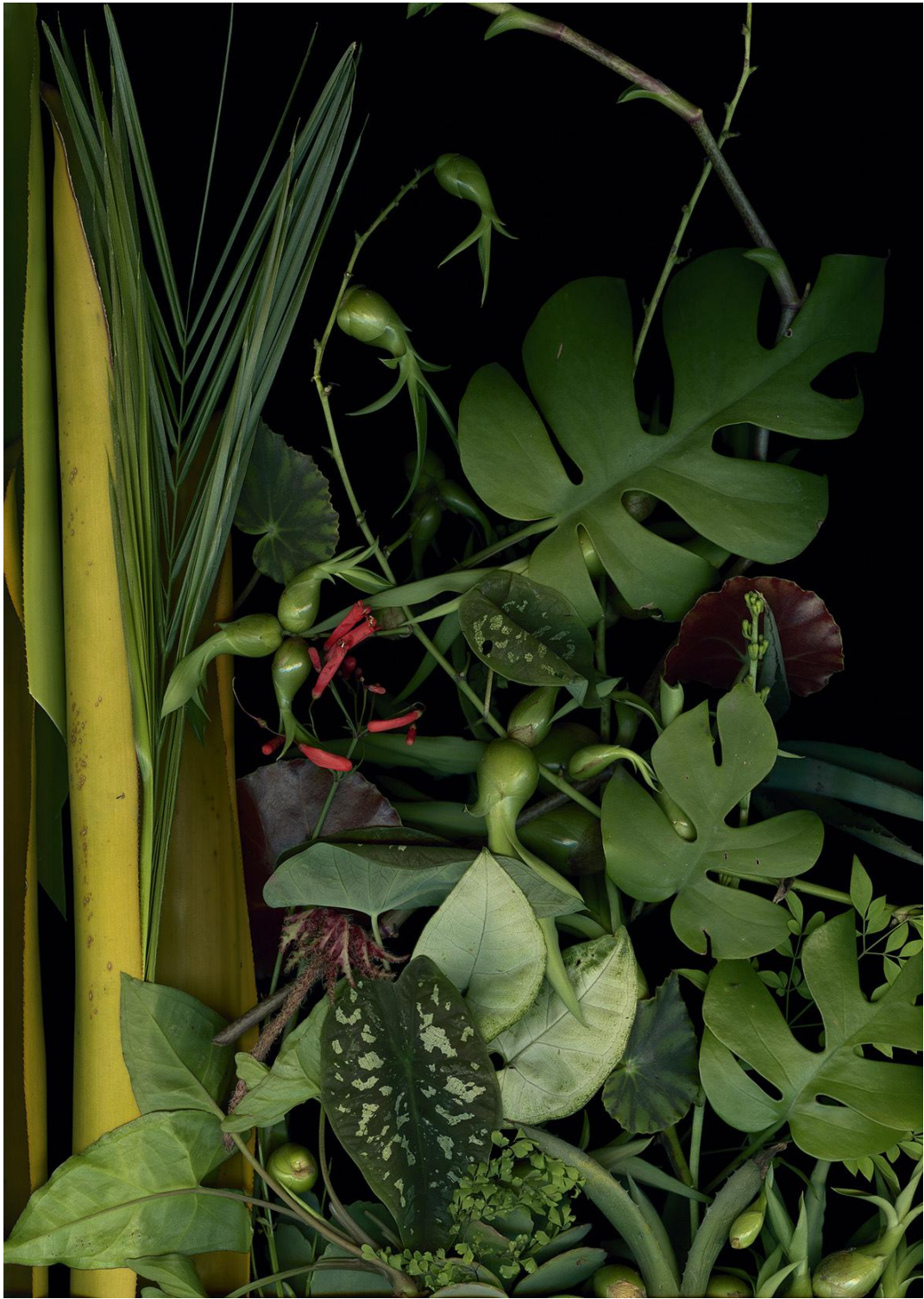
« Jardim 11» - Scannogram, pigment print on Mitsumata Awagami paper- 127 x 90 cm