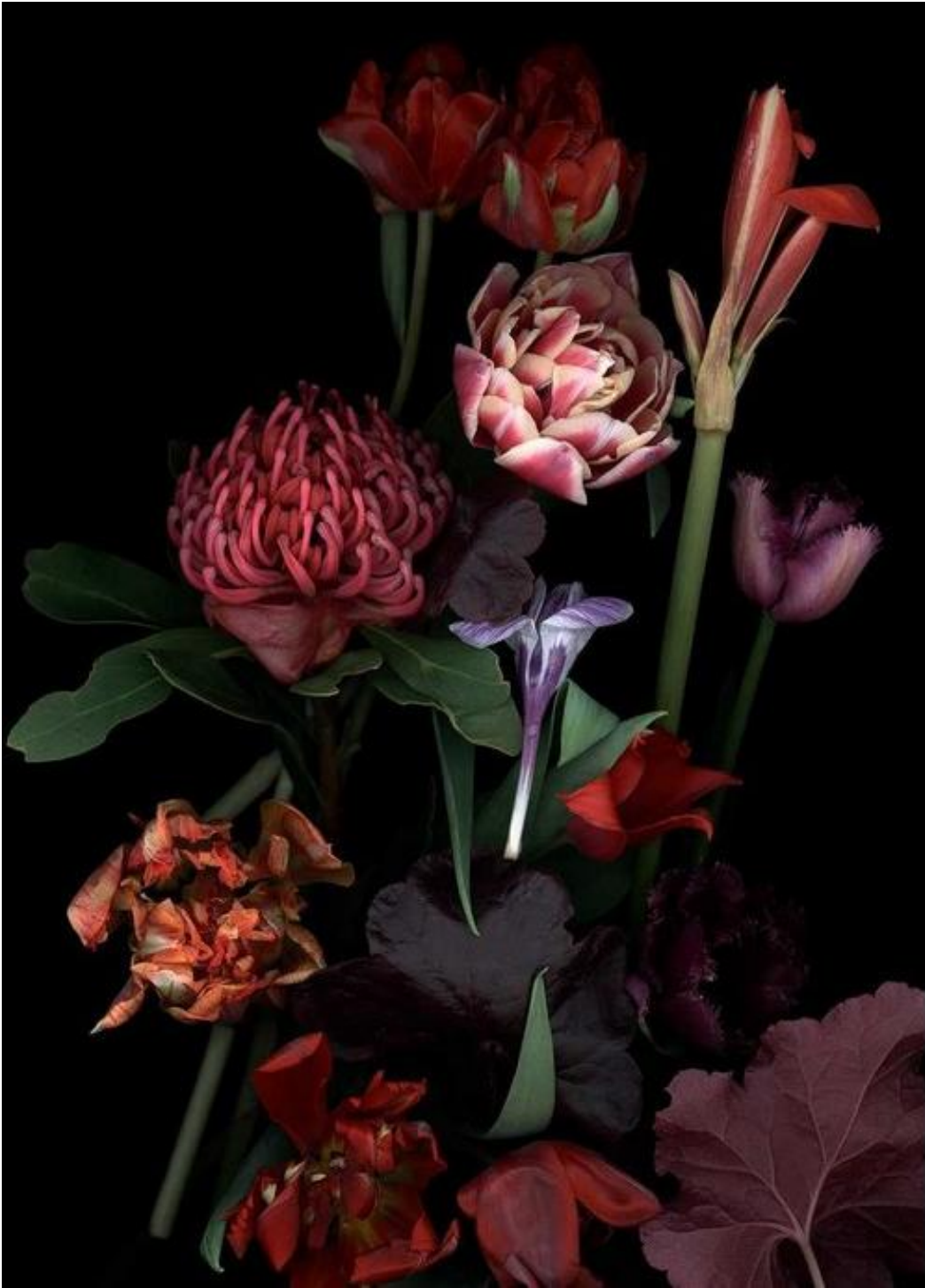
« Stockage 162 » - Lightjet print on diasec- 140 x 100 cm