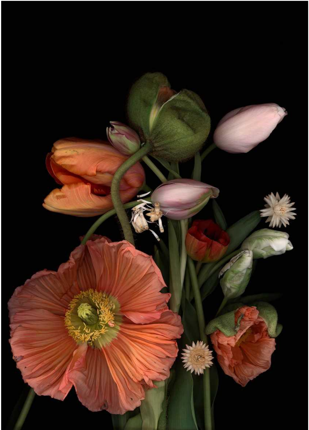
« Stockage 178 » - Lightjet print on diasec - 70 x 50 cm