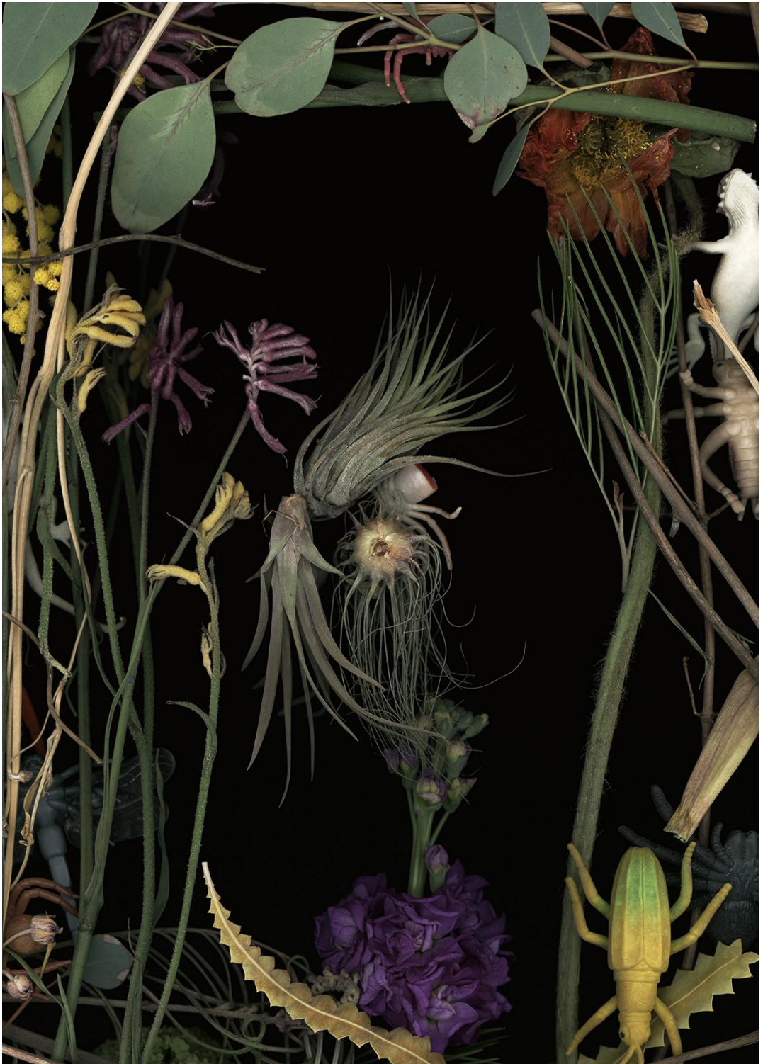
« Lustgarten 01 » - Scannogram printed directly onto aluminium - 45 x 30 cm