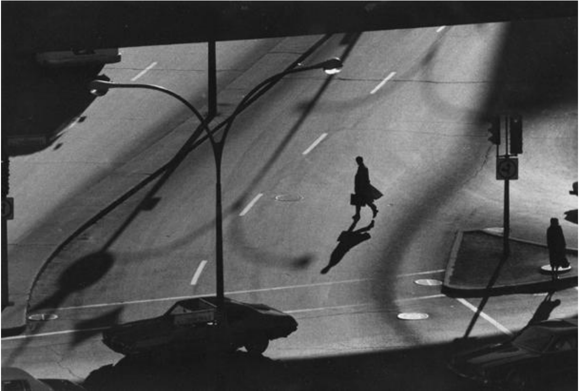
Hervé Gloaguen - 'Montreal 1978' - Signed and numbered silver print