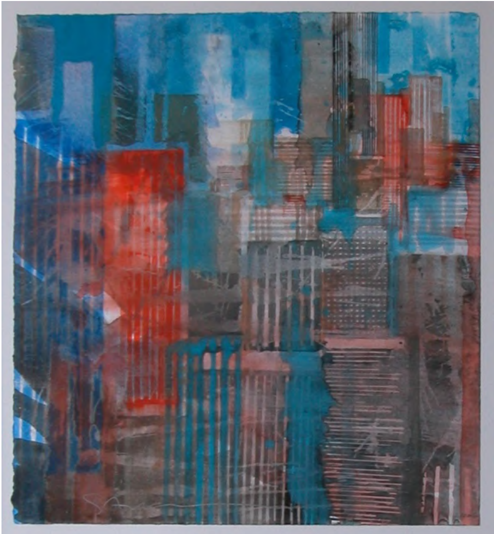
"New York", watercolor on paper, 30 x 24 cm

Exceptional watercolorist, he bursts into the poetry of the cities he paints and transforms. He also seeks interaction with the drawing, printmaking, photography, acrylic and oil painting. He exhibits since 1968 in major international galleries in Europe, Japan, USA... Many publications have been devoted to his work in French, German, English.