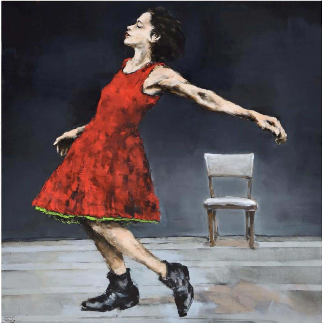
" Walking and falling", oil on canvas, 120 x 120 cm

In his studio, take heart and soul the characters that are both exotic by their physical but close and contemporary by the expressiveness of feelings that give them life. His silent faces subtly speak of a search for the truth to be. He exhibits regularly in Europe since 1991.