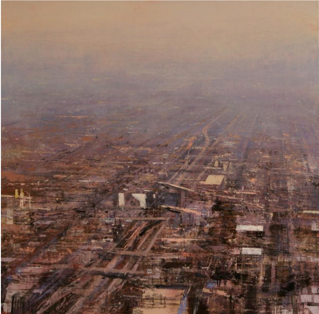
"Luz y rosa violeta in Chicago", Oil on wood, 100 x 100 cm

Urban landscapes, cities, factories, highways he fixes on the canvas, subtract a moment of everyday reality to the constant flow of time. The superposition of firm layers and material effects highlight subtle vibrations. It is a mature work, strong, which plays on the tension between abstraction and referential painting. He has received numerous awards and his work is in many collections.