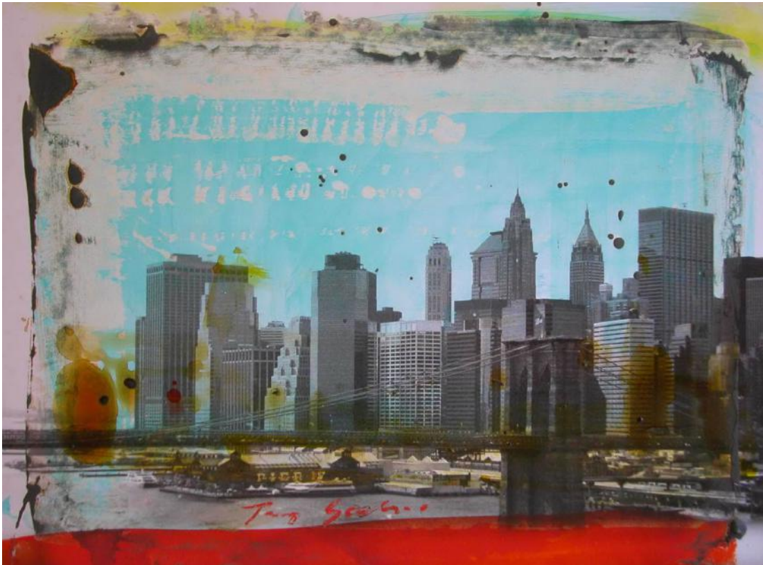
"New York", mixed media on photo, 60 x 80 cm