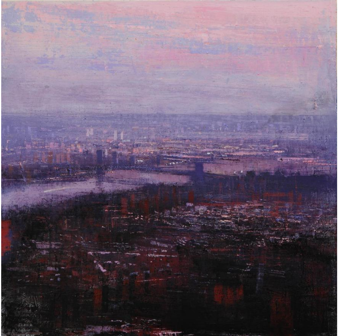
Oil on wood – 85 x 85 cm