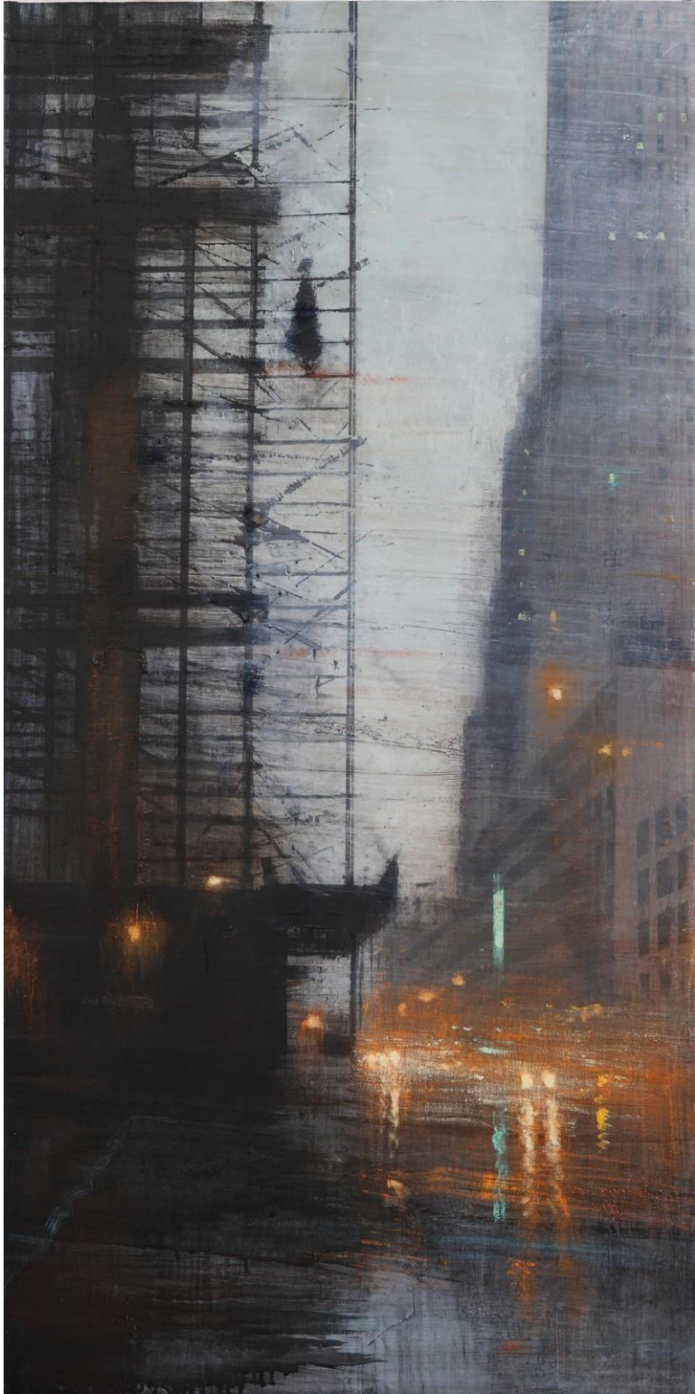
Oil on wood -120 x 60 cm