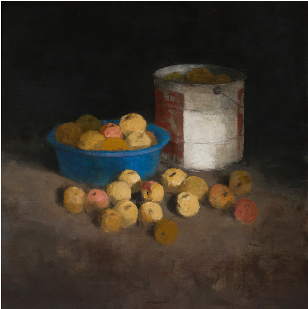
Miguel MACAYA, oil on wood, 122 x 122 cm