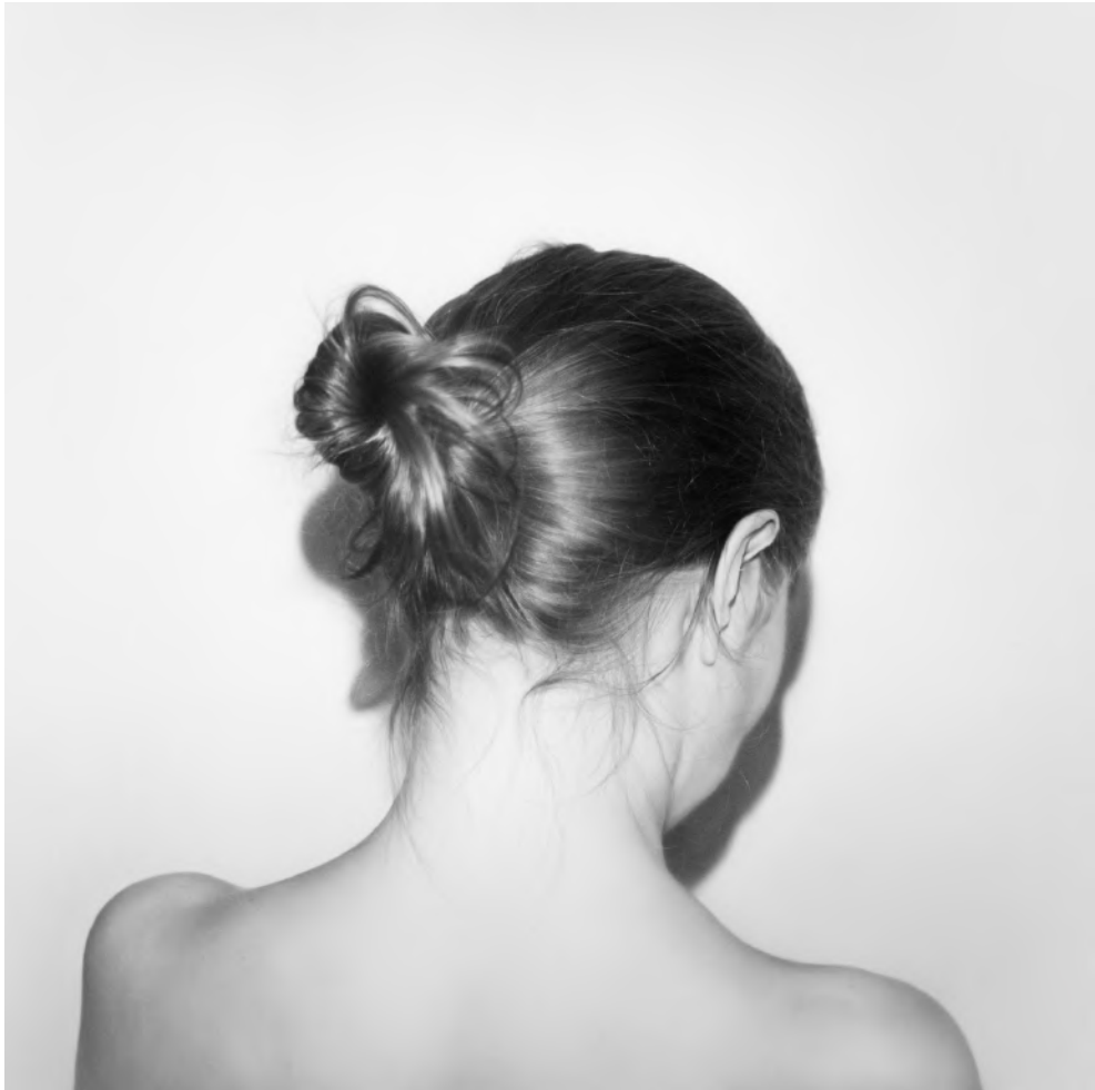
Ivan FRANCO, pencil on paper, 100 x 100 cm