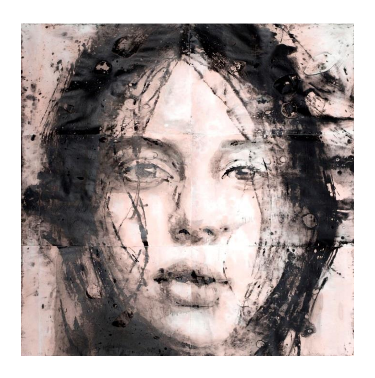
No title – Acrylic and bleach on paper - 180 x 180 cm