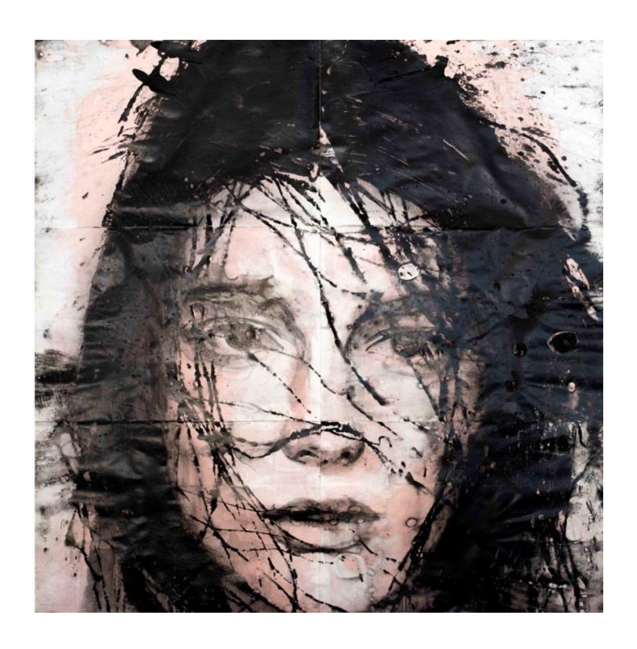
No title – Acrylic and bleach on paper - 180 x 180 cm