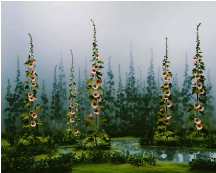
« Le jardin », C- Print