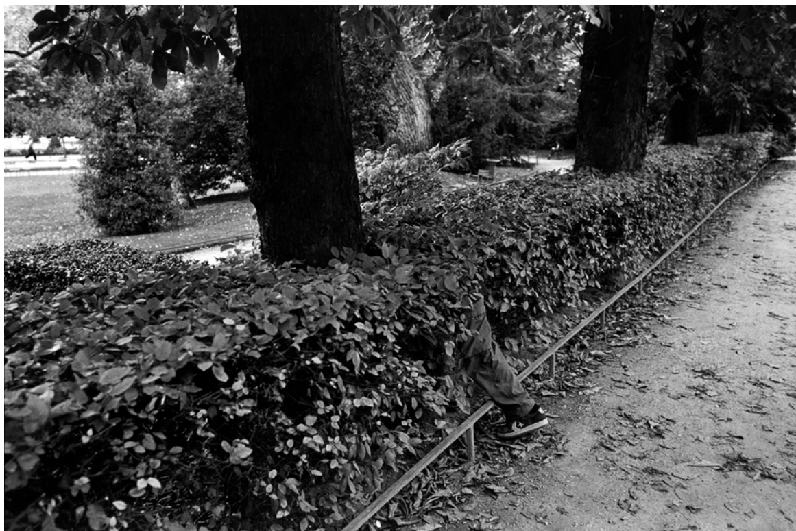
« Jardin du Luxembourg, Paris », black and white silver print