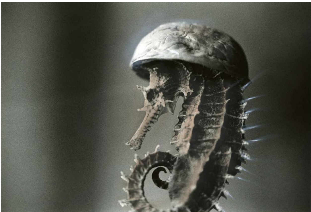
« Helmut », black and white silver print with pastel