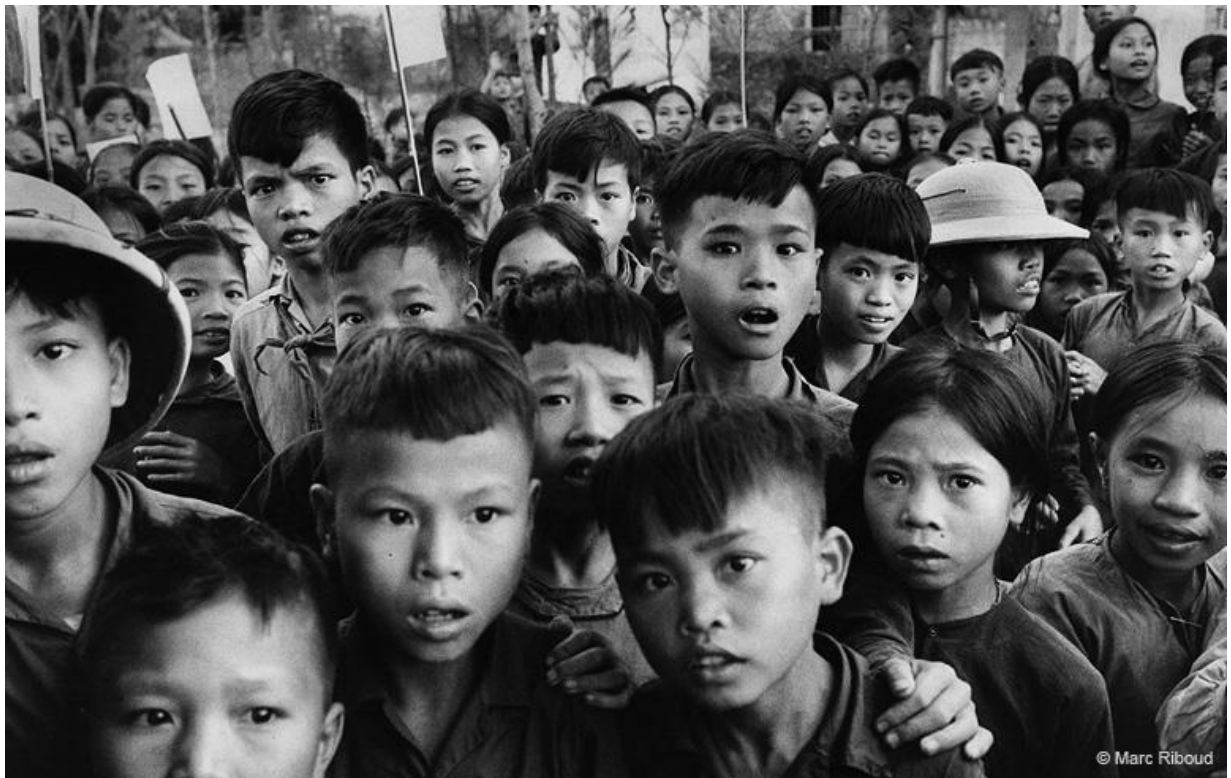
Nord Vietnam, 1969