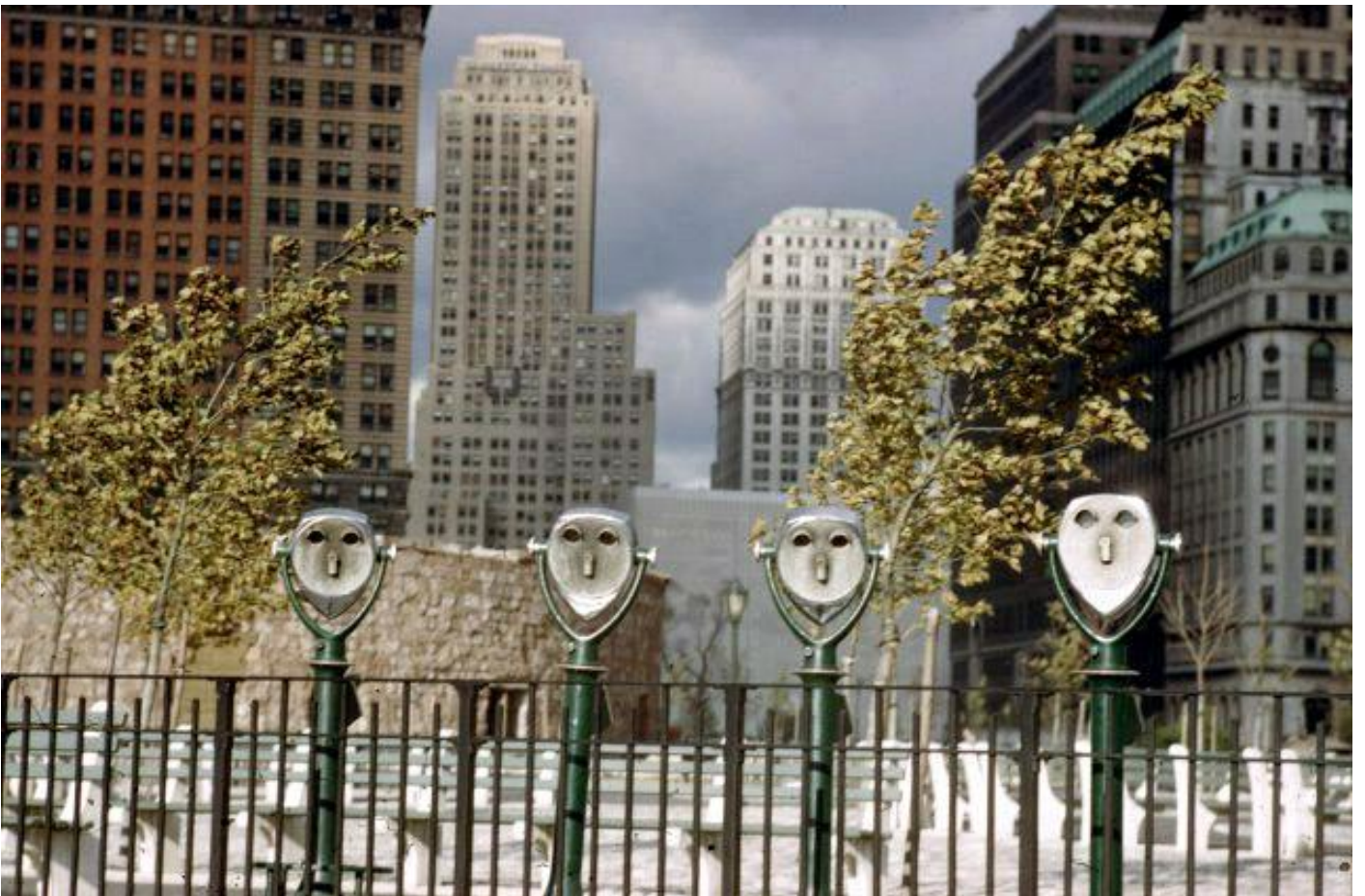
Binoculars, Battery Park, NYC, 1952