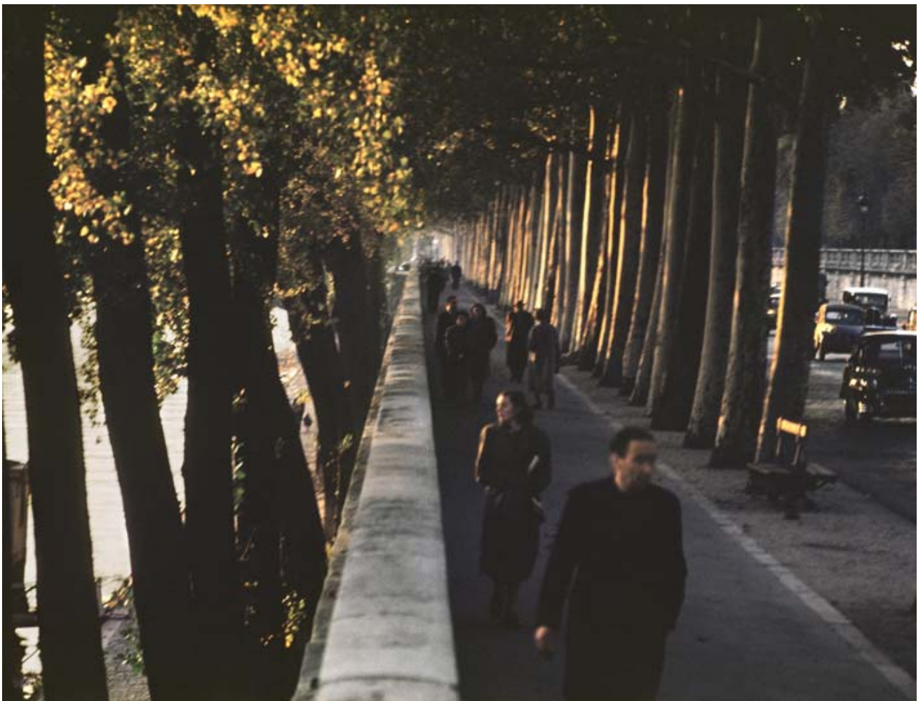
Quai des Tuileries, Paris, 1954