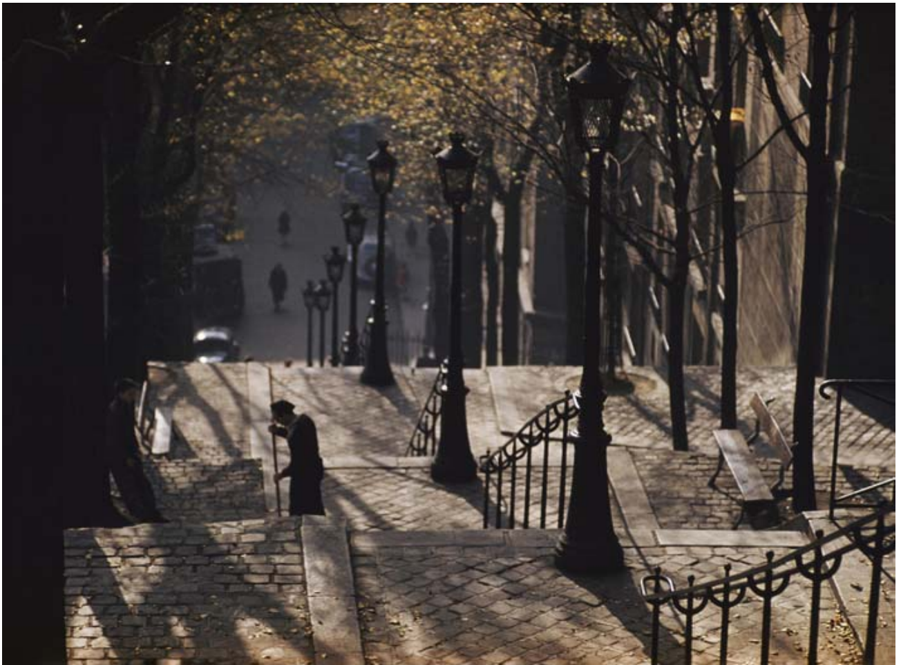
Escalier à Montmartre, Paris, 1954