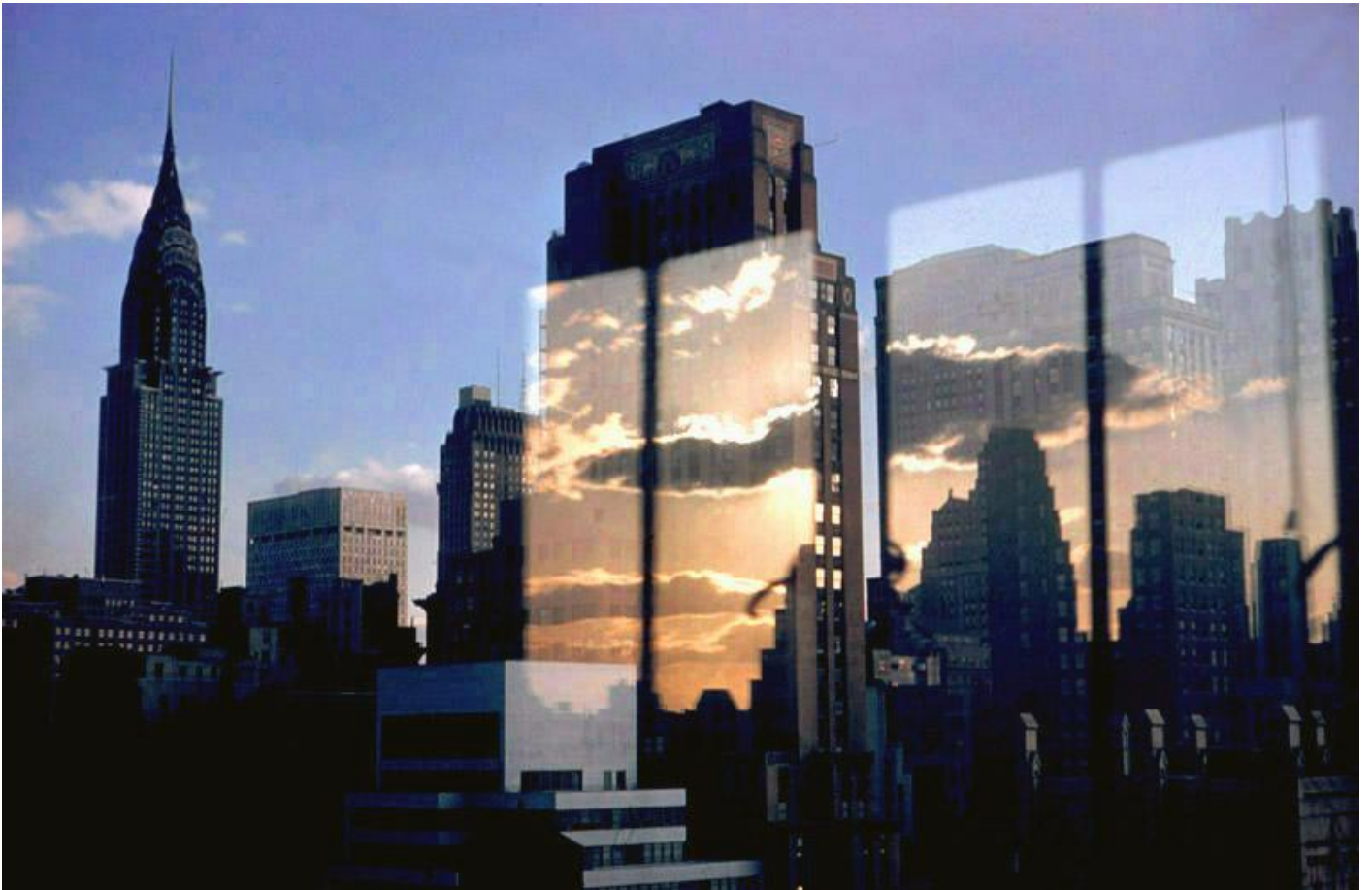
Clouds and Skyline, NYC, 1957