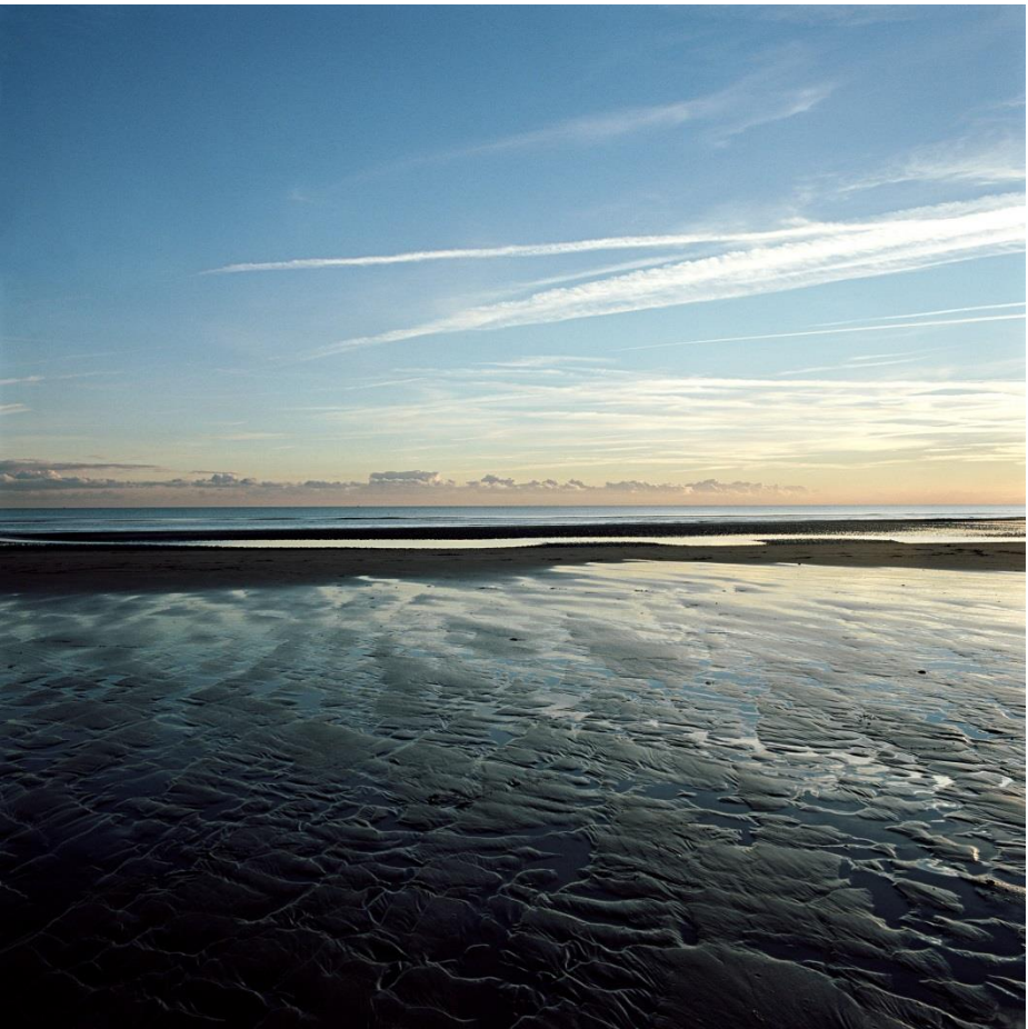
Tim HALL, Camber sands III, impression pigmentaire sur papier aquarelle